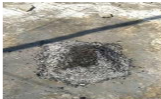
Figure 1: Neem leaves ash